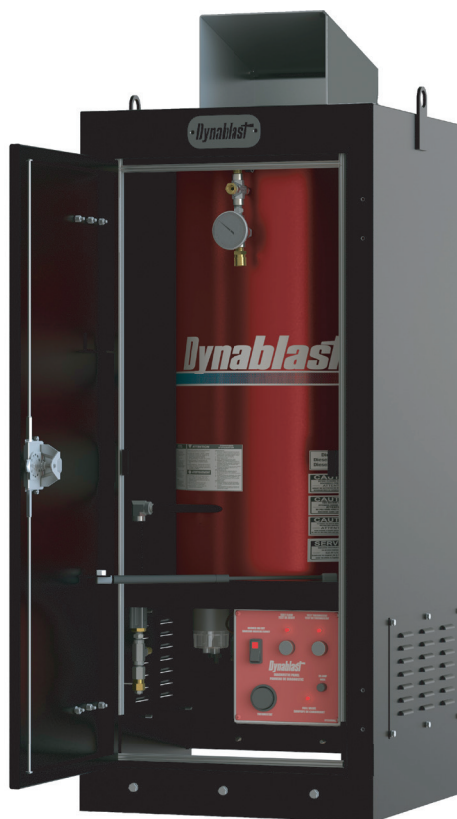
CAB420FLS-12V (Door Open)